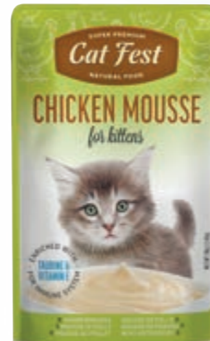
ART. 79218954 COMPOSITION: chicken 58%, yeast extract, prebiotic FOS, anchovy oil, minerals. ADDITIVES: Nutritional Additives: Vitamin E 1000 mg/kg, Taurine 1000 mg/kg.