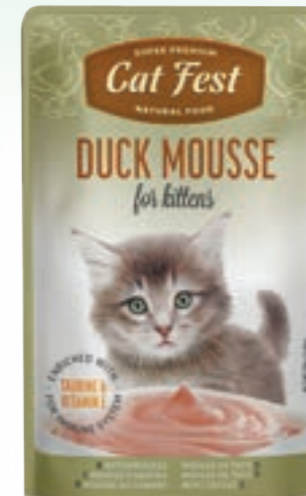
ART. 79218978 COMPOSITION: duck 58%, yeast extract, prebiotic FOS, anchovy oil, minerals. ADDITIVES: Nutritional Additives: Vitamin E 1000 mg/kg, Taurine 1000 mg/kg.