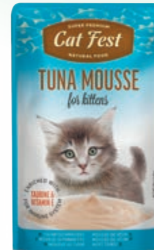
ART. 79218961 COMPOSITION: tuna 58%, yeast extract, prebiotic FOS, anchovy oil, minerals. ADDITIVES: Nutritional Additives: Vitamin E 1000 mg/kg, Taurine 1000 mg/kg.