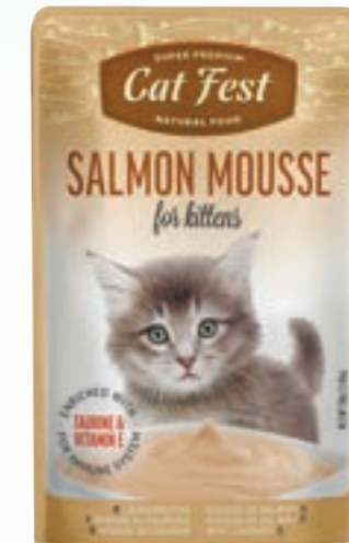
ART. 79218985 COMPOSITION: salmon 58%, yeast extract, prebiotic FOS, anchovy oil, minerals. ADDITIVES: Nutritional Additives: Vitamin E 1000 mg/kg, Taurine 1000 mg/kg.